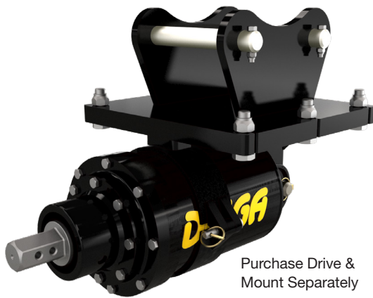
Purchase Drive & Mount Separately