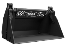
Mini 4 in 1 Bucket