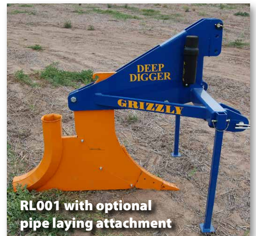
RL001 with optional pipe laying attachment